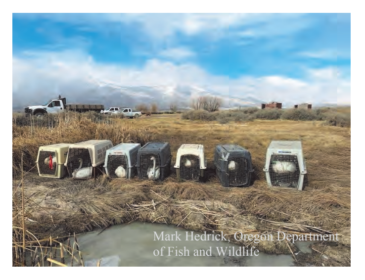
Photo above: Swans with both GPS/GSM tracking collars and green non tracking collars are ready for release at Summer Lake Wildlife Area.

Thanks to you, a dozen swans received GPS/GSM collars in February. Alexa Martinez holds one of the swans that was captured and collared during a bitterly cold night at Oregon's Malheur National Wildlife Refuge.